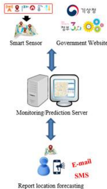
Fig. 1. System Overview

Every year, lots of cities have water flooded or waterlogging problem in China. At the same time, the world is facing a challenge of water shortage. To address this issue, the authors [2] showed the study of a stormwater management system. Their experimental results indicated that the numerical error of predicted value shows a downward trend, and it gradually tends to its real value.